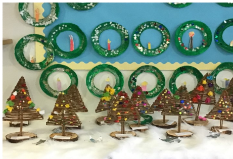
Robins trees Woodpeckers Wreaths

For more pictures, please visit the class pages on our website.