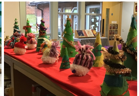
Wagtails trees and pom pom heads