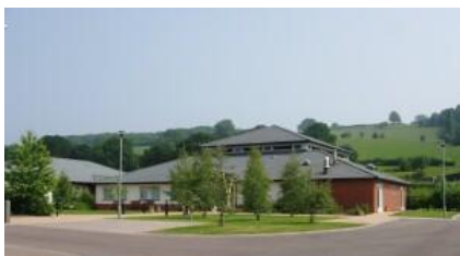
The school site is DDA Approved.

We aim to support all children in a culture which acknowledges their entitlement to share the same learning experiences that their peers enjoy. This is predominantly ensured by offering quality first teaching delivered by teachers in the classroom. However, at times in a child's development they may require additional provision to support their progress